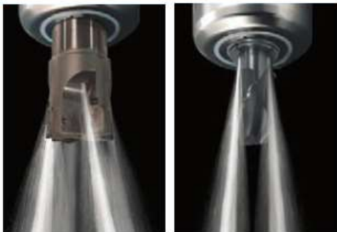
For cutters with coolant hole